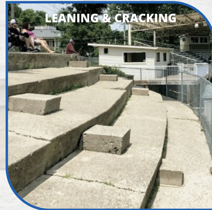
LEANING & CRACKING